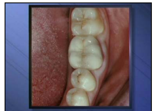
A natural looking result

During your next visit, we remove the temporary crown and place your new crown. We check the fit and your bite. When everything looks good, we cement it in place and you'll have a new porcelain crown.